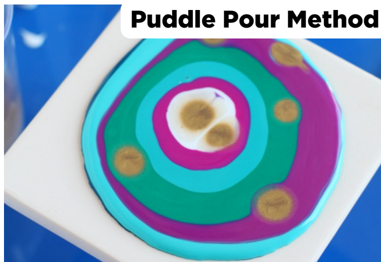
Puddle Pour Method