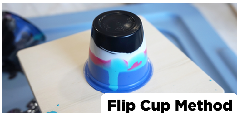
Flip Cup Method